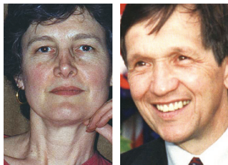
'He actually is a politician who lives by his principles.'

jkraus@johnedwards2004.com www.johnedwards2004.com