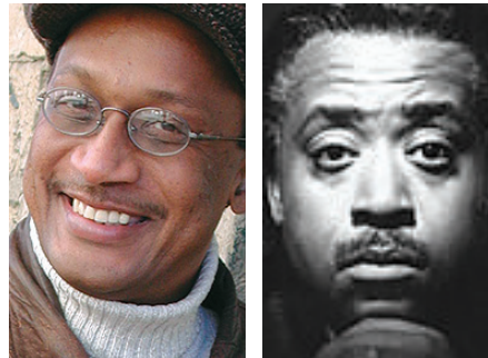
'I am impressed with his working knowledge of the big issues.'

Kucinich Headquarters 1800 Parmenter St., Suite 204 Middleton, WI 53562 824-0588 www.kucinich.us