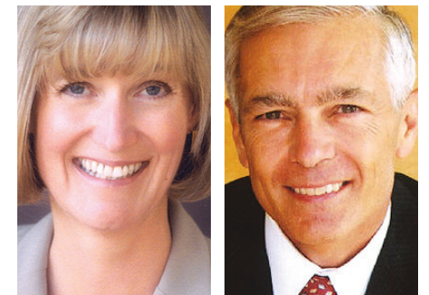
'He comes unencumbered by the compromises of past political life.'